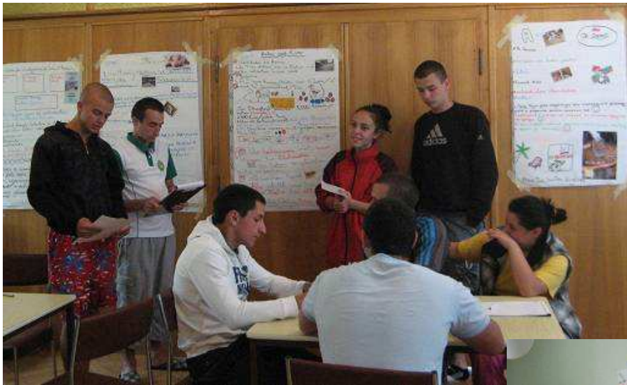
Different days: presentation of group workshop results