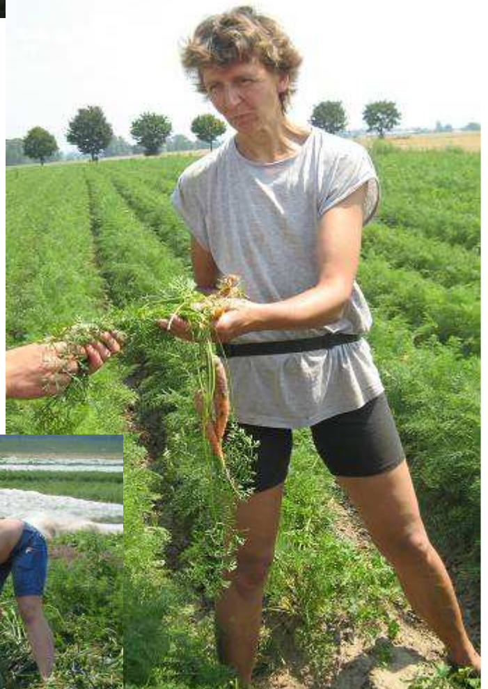
26.07.12: harvesting organic vegetables at „Bio-Bauernhof Franz“