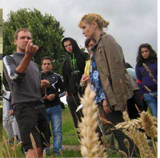
12.07.12, Hof Mahlitzsch: getting to know milk processing technology