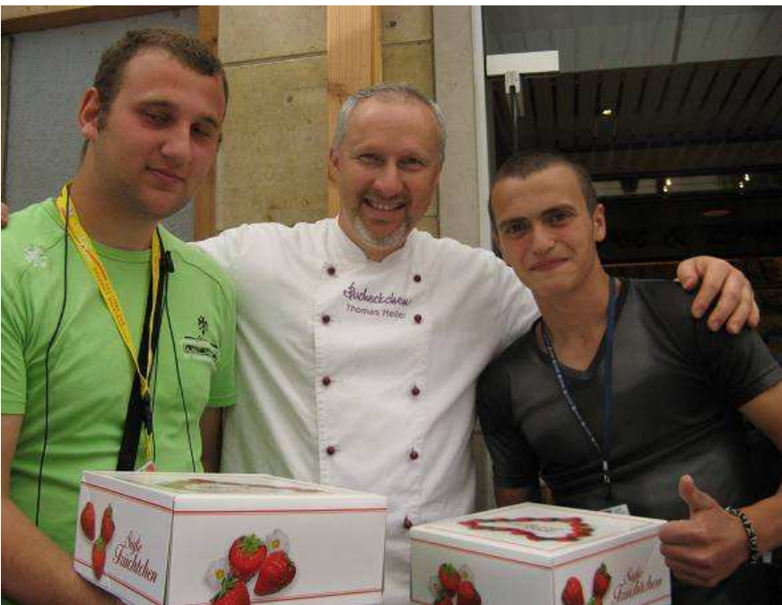
09.07.12: making organic cake at „Bucheckchen“