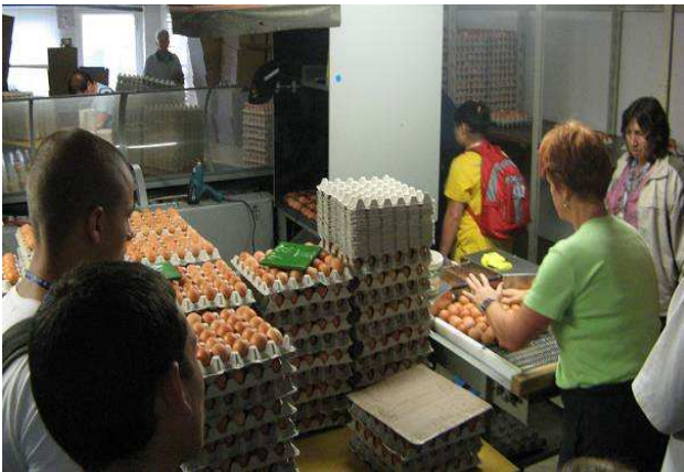
Egg storage in Stadgut Görlitz, 04.07.12