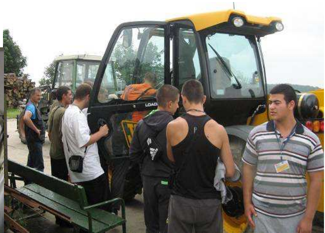
Getting to know machinery in Stadgut Görlitz, 04.07.12