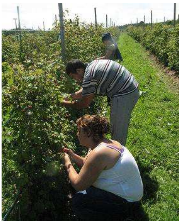
11.07.12: organic berry cultivation in Theisewitz