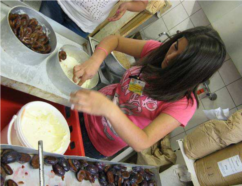
09.07.12: making organic cake at „Bucheckchen“