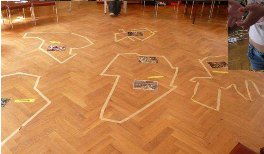
16.07.12: pupils were illustrating food consumption on different continents.