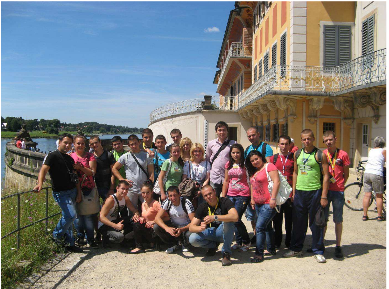
23.07.12: after the visit of the Agricultural University of Dresden-Pillnitz