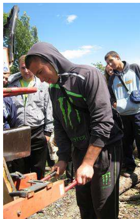
12.07.12: adjusting machinery in Hof Mahlitzsch