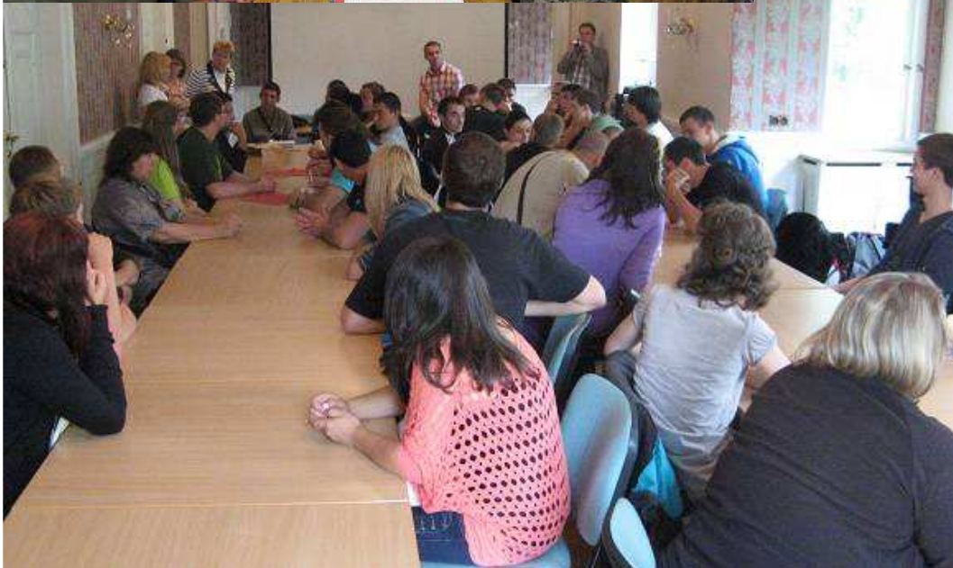
18.07.12 and 23.07.12: meeting up other educational institutions and fellow pupils/students at BSZ and Pillnitz