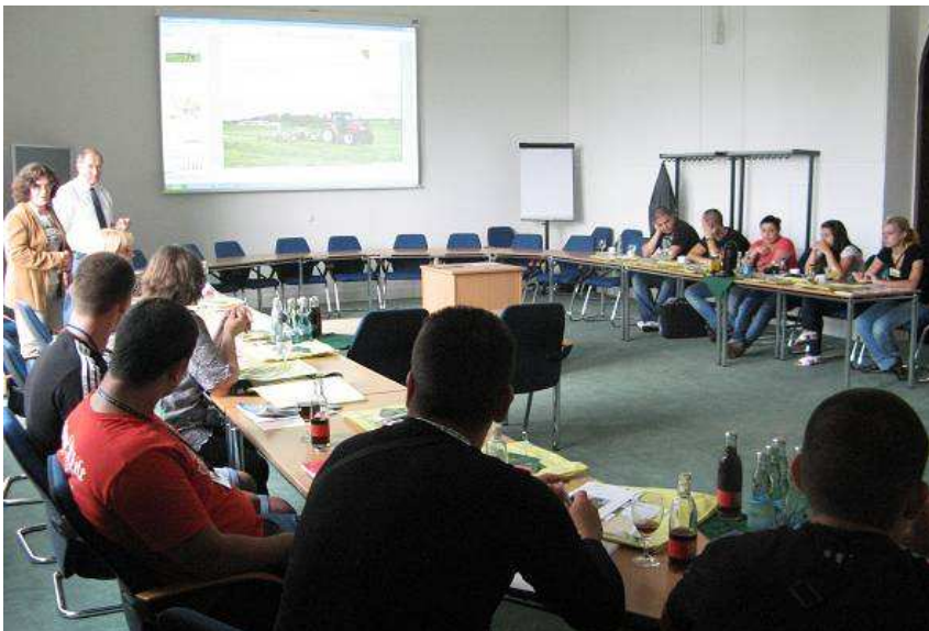
05.07.12: in the Saxonian Ministry